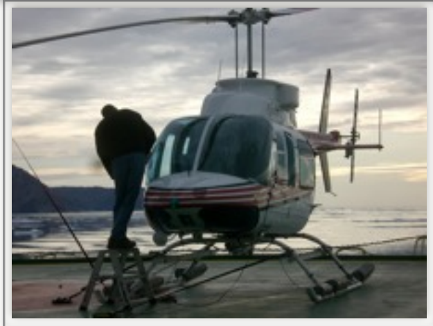
Long Ranger working in the Northwest Passage, Nunavut.